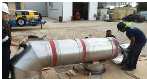
FIGURE 1 .0